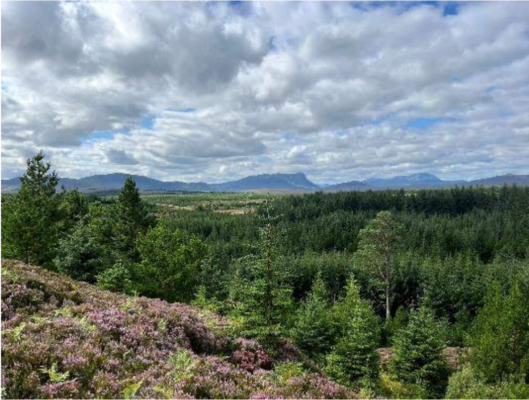
Borgie, Highlands. 3 landowners.

Scotland continues to have one of the most unequal patterns of land ownership in the global north.