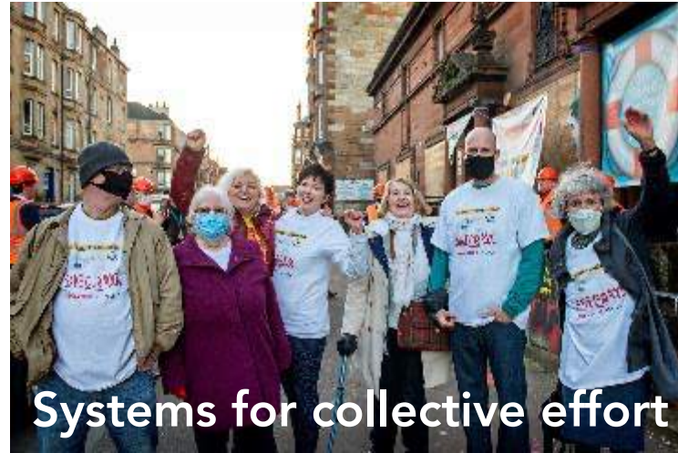
Systems for collective effort