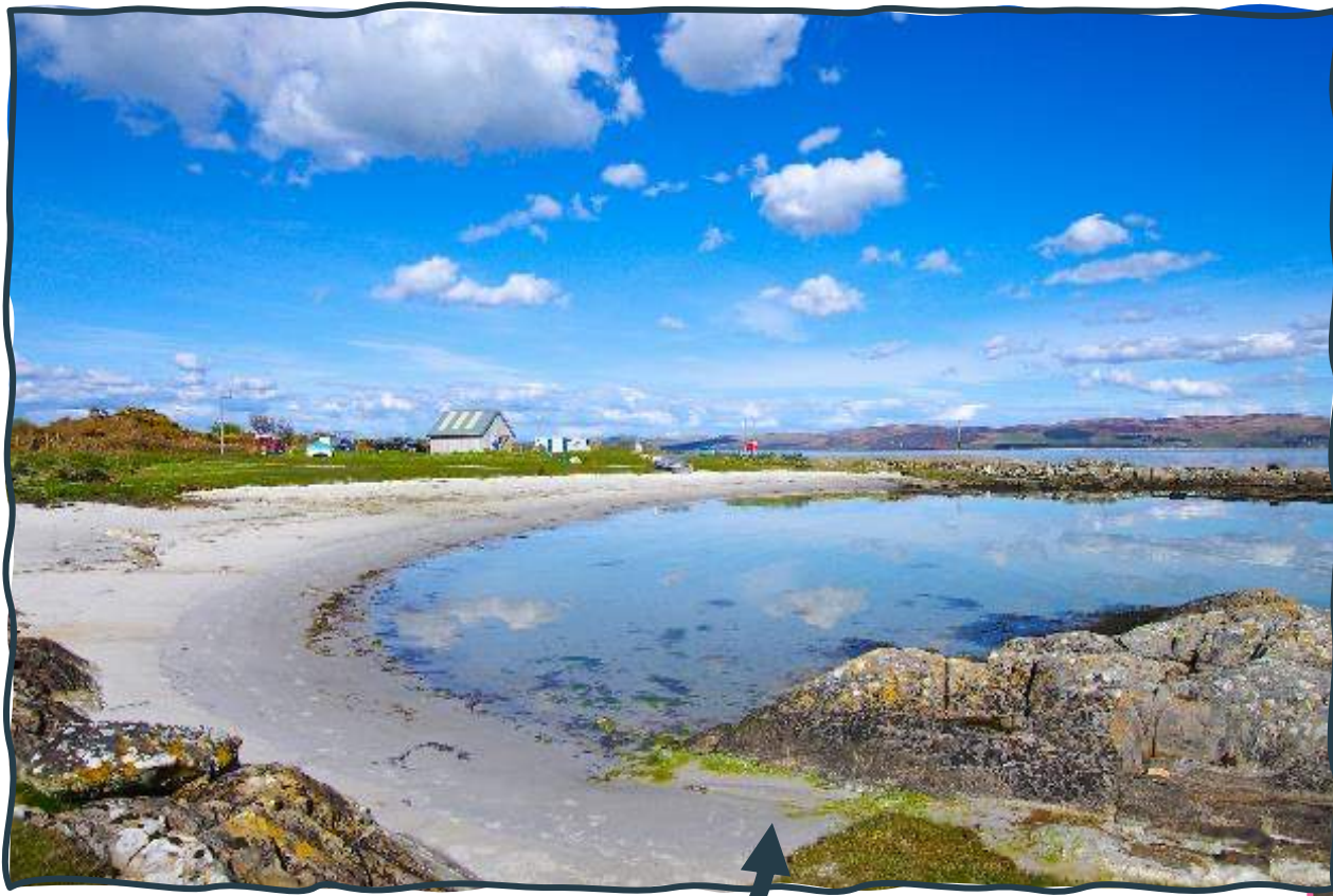
Isle of Gigha