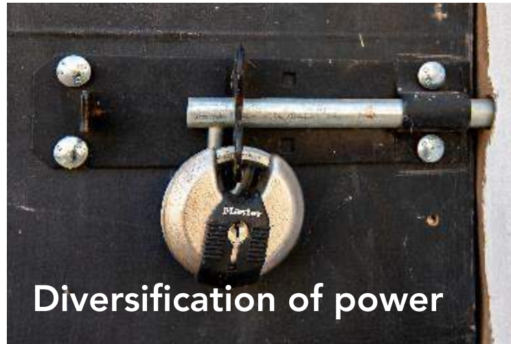
Diversification of power