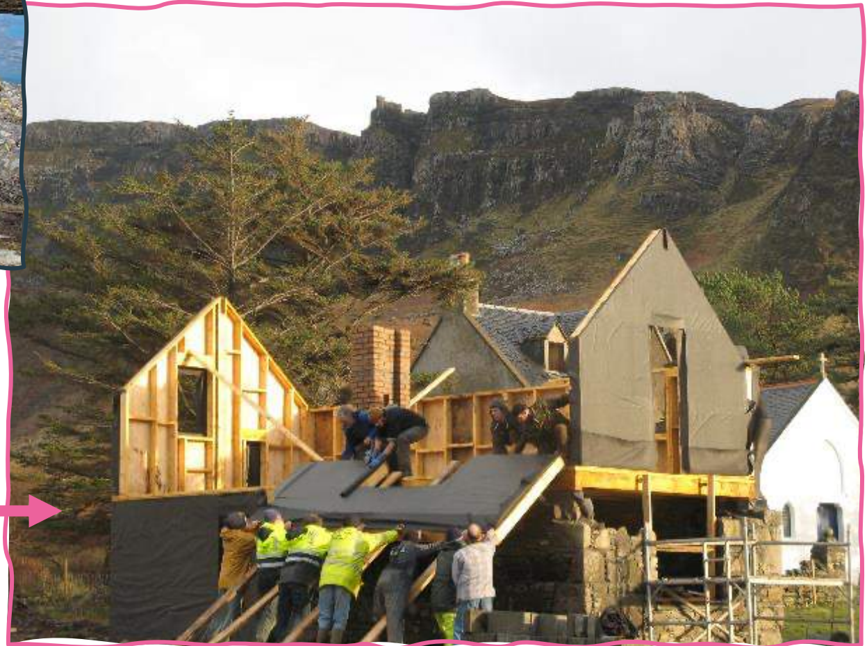
Isle of Eigg