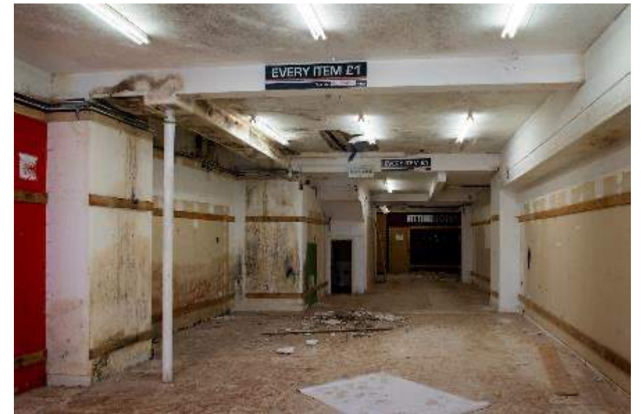
Midsteeple Quarter, Dumfries.