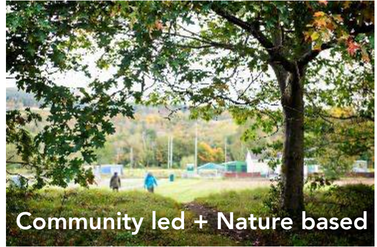
Community led + Nature based